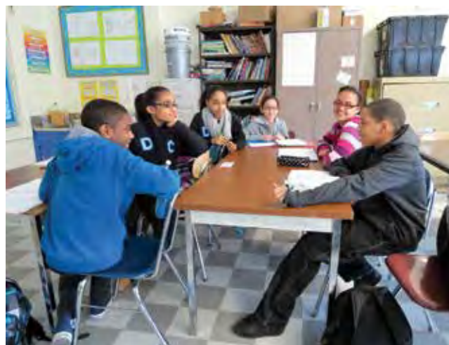
Students working together to prepare their arguments.

Assessing the quality of arguments, either spoken or written, is not an easy task. For instance, there are often numerous aspects of students' writing that could be addressed, but it is difficult to know which are the most important. The in-the-moment appraisal required of spoken arguments can be even more difficult, because teachers need to make a quick assess-