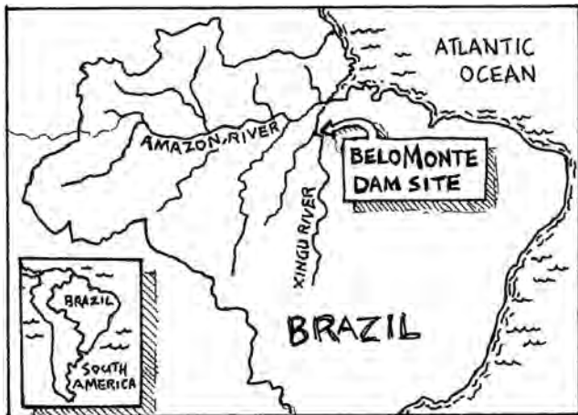
FIGURE 3 Proposed location of the Belo Monte Dam